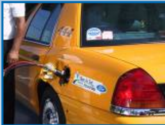
Taxis & Shuttles