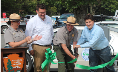
Ribbon-cutting for the National Park Service electric vehicle program.

Stakeholder Funds helps us pursue strategic opportunities that further bolster our work and develop new programs that support our mission, our community and our planet.